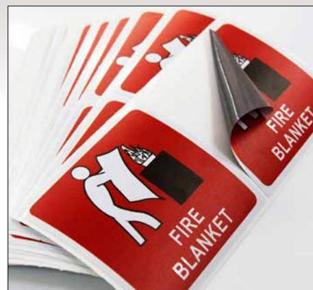
Stickers with grey back for no 'show through'