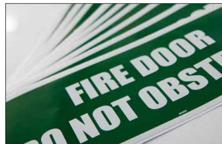
Permanent adhesive for long term install