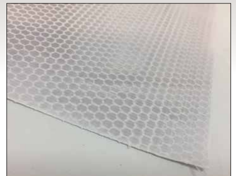
Class 1 - High Intensity Grade Reflective