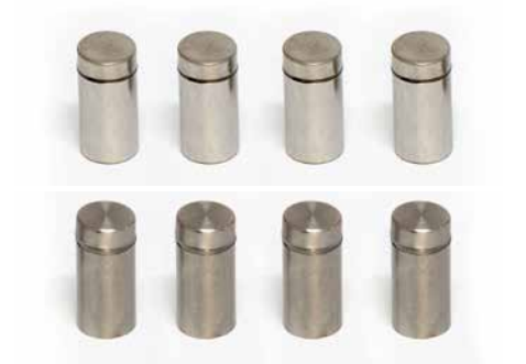
Polished and brushed standoffs available in 12mm