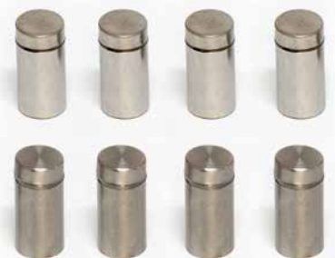
Polished and brushed standoffs available in 12mm