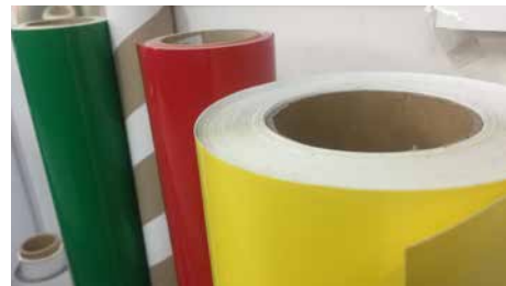
A variety of colours in stock