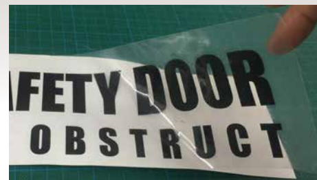
Mounted onto clear application tape