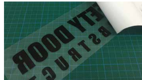
Peeled and ready for installation