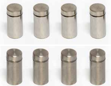
Polished and brushed standoffs available in 12mm