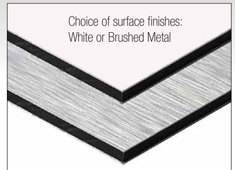
Choice of finishes